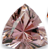
Semi-precious stones cut by faceting students