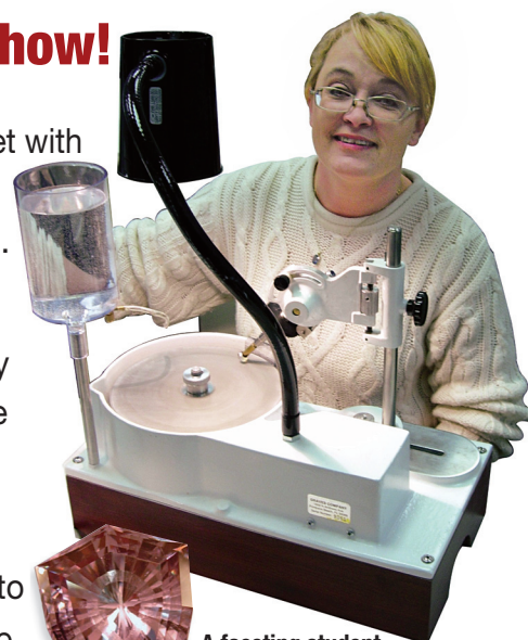
A faceting student shaping a gem